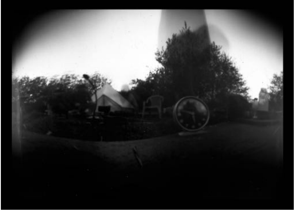
Pinhole Camera workshop led by Stuart Robinson.

A darkroom was constructed on-site within Paul Chaney's hazel bender using theatre black out curtains.